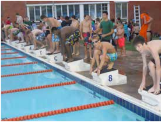
Highway scouts about to dive off in a 100 meter freestyle event.